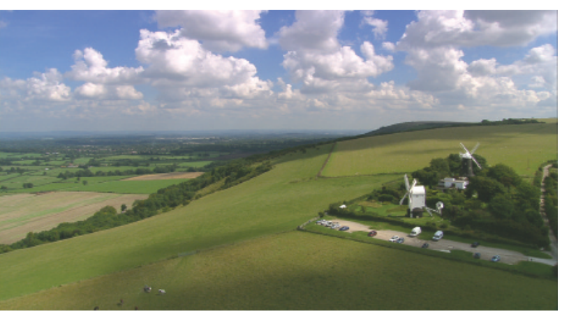
The Sussex Downs. Rudyard Kipling, who lived in Sussex, called them the 'blunt, bow-headed, whale-backed downs.'