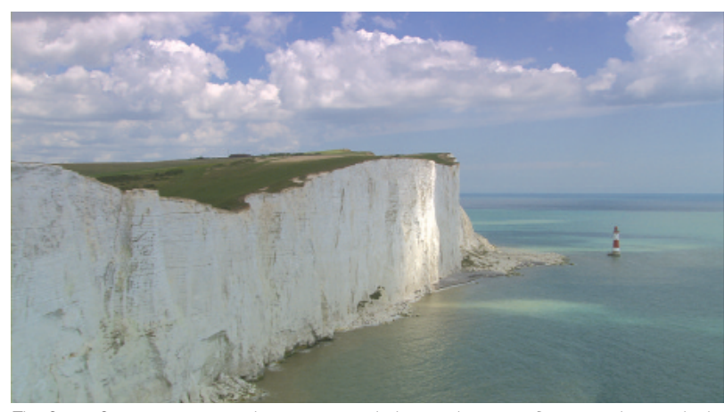
The Seven Sisters are among the most unspoiled coastal areas in Britain and certainly the most dramatic.

Left: The Long Man of Wilmington at 73m high is perhaps the largest outline of a human figure in Europe.